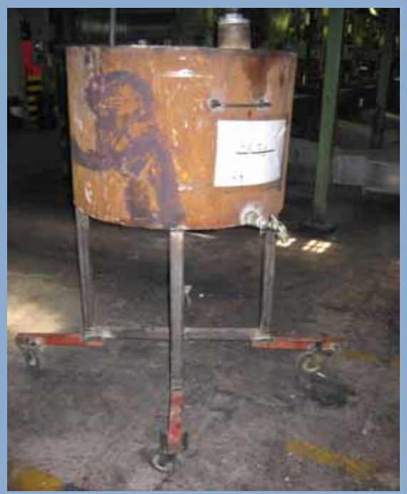
After: closed vessel with valve